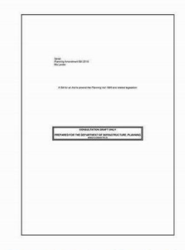
Consultation Draft of a Bill for Amendments to the Planning Act 1999