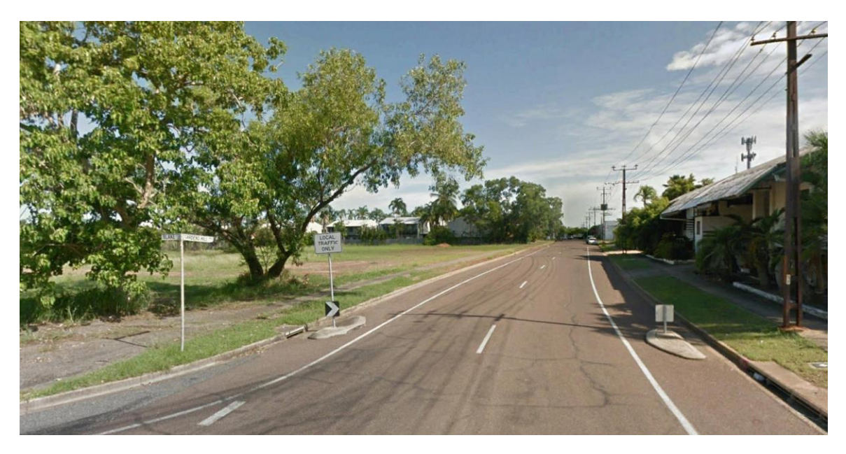
Figure 9b : Existing condition of verge on west side of Gardens Hill Crescent