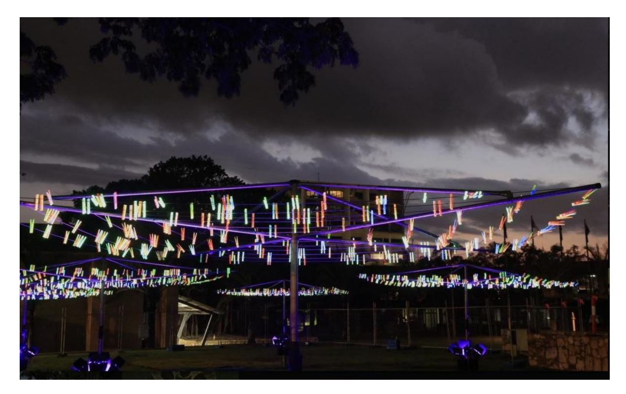
Figure 8a : Image of an installation in the Tropical Light exhibition, Civic Square, Darwin CBD (Bruce Munro Studio)