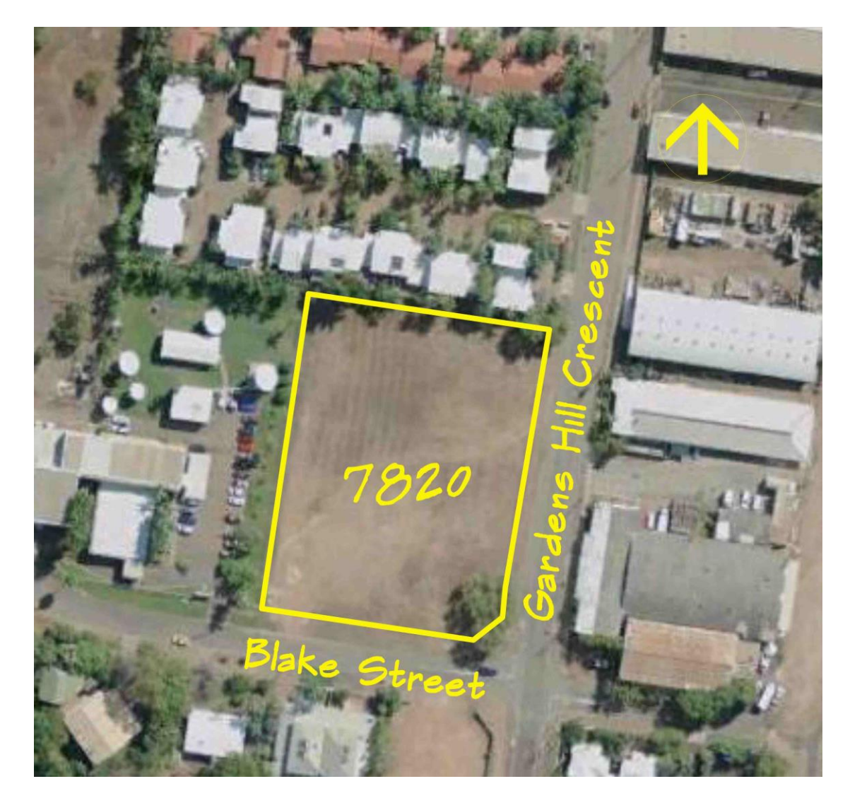
Figure 3 : Current site condition

The site is at an elevation of about 27 AHD, and is level, cleared and vacant. The condition of the site is shown in the aerial image at Figure 3.