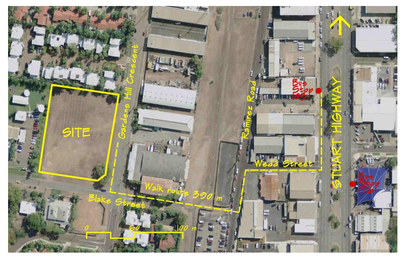
Figure 4 : Walk route to bus stops

The site is very close to public transport routes. A bus stop (Bus Stop 103) for outbound bus travel is located in Stuart Highway, approximately 390 m walking distance from the site. For inbound travel, the bus stop (Bus Stop 176) is located near the intersection of Stuart Highway and King Street, approximately 350 m from the site. The locations of bus stops in relation to the site are shown in Figure 4.