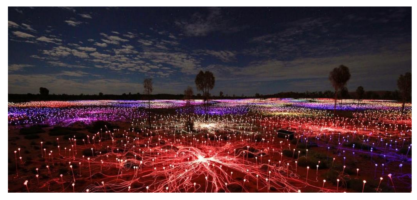
Figure 7 : Image of Field of Light, Uluru

Bruce Munro's work in the Territory includes "Field of Light" at Uluru, commencing in April 2016, and Tropical Light in Darwin CBD from November 2019 to March 2020.