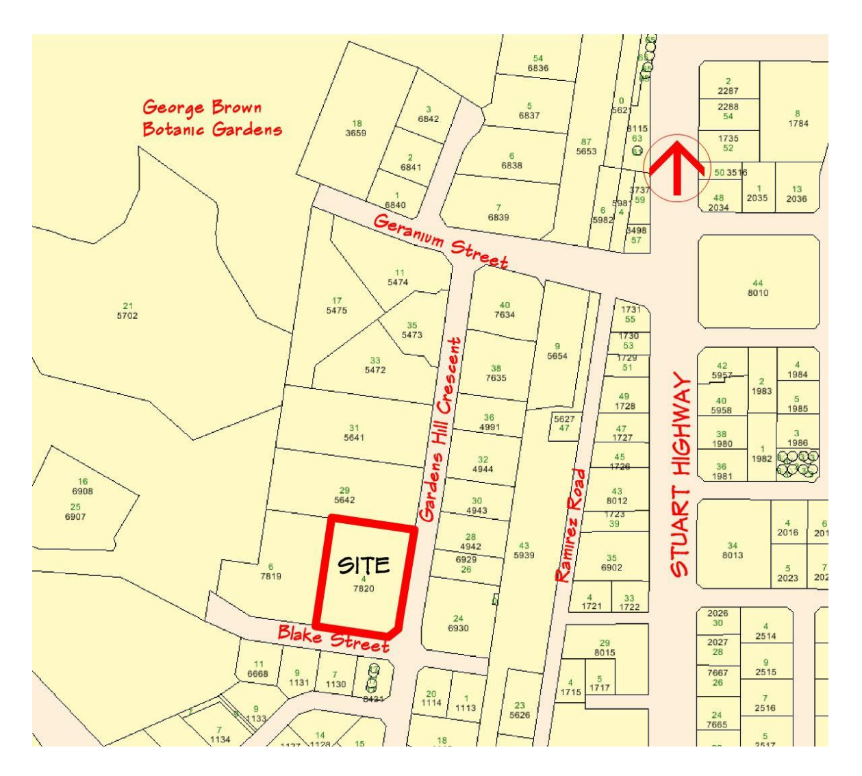
Figure 1 : Locality Diagram

The land in located at 4 Blake Street, The Gardens, as shown in the locality diagram in Figure 1.