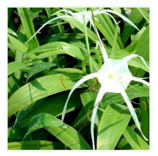
Figure 6b : Hymenocallis, the inspiration for firefly form