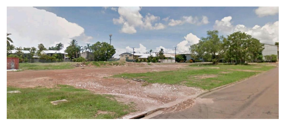
Figure 9a : Existing condition of verge on north side of Blake Street

The proposal will include new pedestrian crossings, footpaths, street trees, public art, gardens, feature paving, seating, water point, and visible activity of interest to pedestrians as detailed in the sections mentioned above and in the Landscape Drawings.