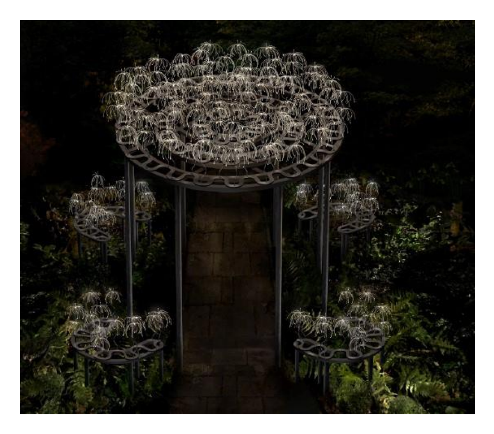
Figure 6a : Image of Tropical Bothy (Bruce Munro Studio)

The installation is described by the artist, whose medium is light, as a stainless steel sculptural gazebo, with the lighting effect created by a host of fireflies in a form resembling the spider lily.