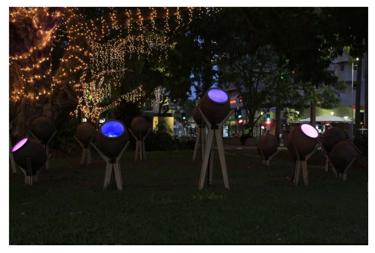
Figure 8b : Image of an installation in the Tropical Light exhibition, Raintree Park, Darwin CBD

Bruce Munro is an internationally acclaimed artist. His works in the Territory have so far been exhibitions of finite duration. Tropical Bothy in the proposed development will be his first permanent installation in the Territory, and will establish a new benchmark for public art in residential developments.