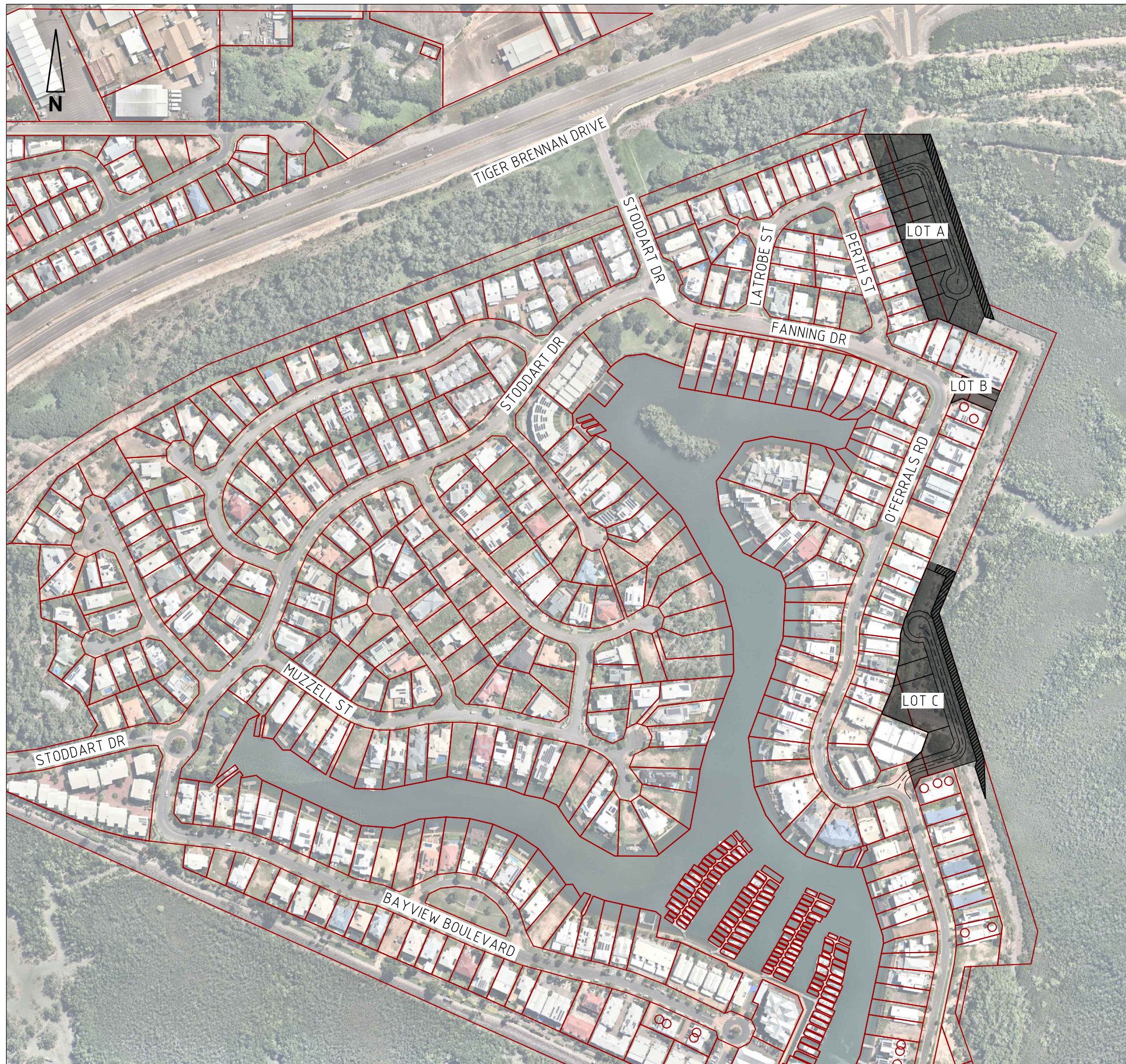
LOCALITY LAYOUT SCALE 1:2000