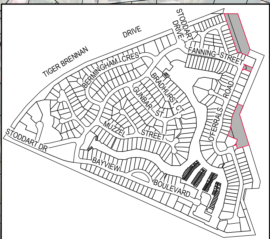
LOCATION DIAGRAM Not to Scale

Area C Refer to plan 8093/29A for details