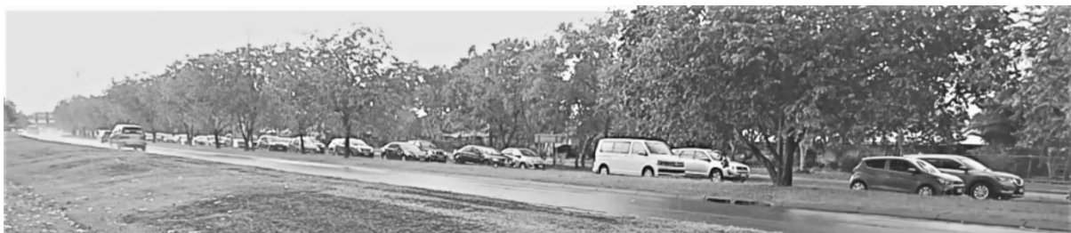
Vanderlin/Lee Point Road roundabout (looking east) – morning peak hour – Sept 2020

During the morning peak hour, vehicles heading south from Lee Point to the Vanderlin/Lee Point Road roundabout causes vehicles to queue on the eastern side of the roundabout. Traffic delays from queueing (see photo below) were generally less than two minutes.