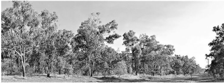
Photo of Lee Point Road (looking north), Lot 4873 on the left, and lot 9370 on the right.