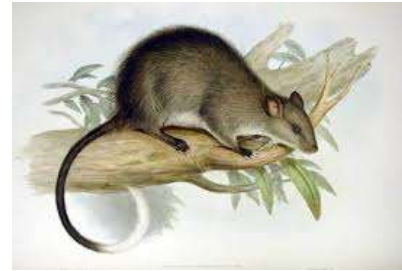
Black Footed Tree Rat (Wikipedia)

Options to deal with feral and domestic cats such as; cat containment, trapping of cats and cat proof fencing all involve capital and maintenance costs for the taxpayer.