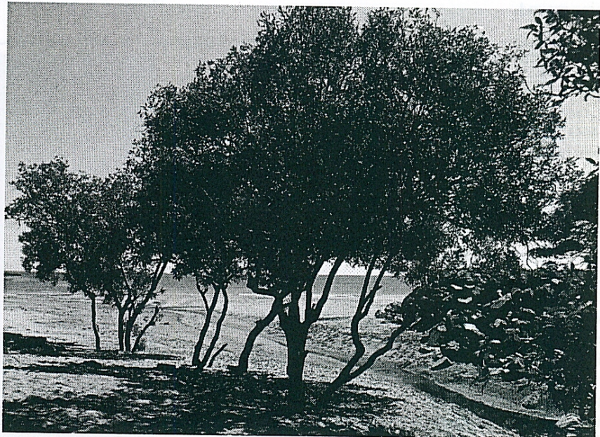
'Little Mindil' (July 2006)—community space, a species threatened by 'eco-tourism' proposal.