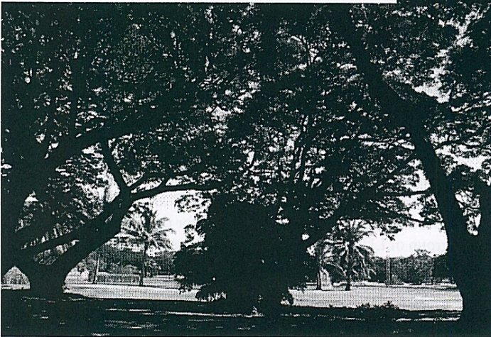
• Wide vistas in a tropical garden setting are available for golfers by day and cultural events at other times. One of the few open public spaces close to Darwin still available for broad community amenity. (L): Iconic raintrees, shady havens with peaceful, uncluttered views of the golf lawns and gardens for all—or of another poorly-planned, tacky, tourist dollar-earner for the few?