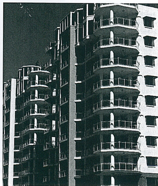
The edge of a block of dense concrete jungle, McMinn Street, Darwin (or Bondi?): minimum amenity, maximum profit.

Recent Northern Territory Governments have lacked effectiveness in achieving city plans, including public facilities, both in Palmerston and Darwin. Both have facilitated development, and mostly ignored the rest. Development enterprise does not take care of community needs because its focus is on maximising profit. Some recent development outcomes show little regard for local character and civic impact. Government has yet to pick up on its role of ensuring good physical layouts, functional linkages, public facilities and amenity.