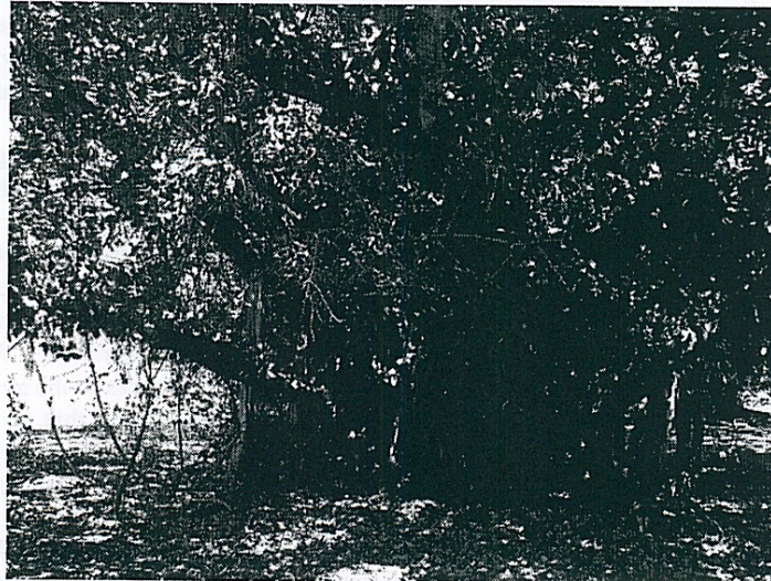
'Little Mindil': should public access to this fast-vanishing type of environment around Darwin be denied for an 'eco-resort'?

Skycity Darwin already prevents public access through its grounds to Mindil Beach. We understand perpetual access was guaranteed when the casino was built on the public camping ground.