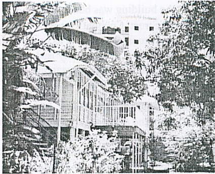
(Above): Old Admiralty House, May 2004. (Below & right): May 2005: note razored gardens, & dwarfing by high-rise.