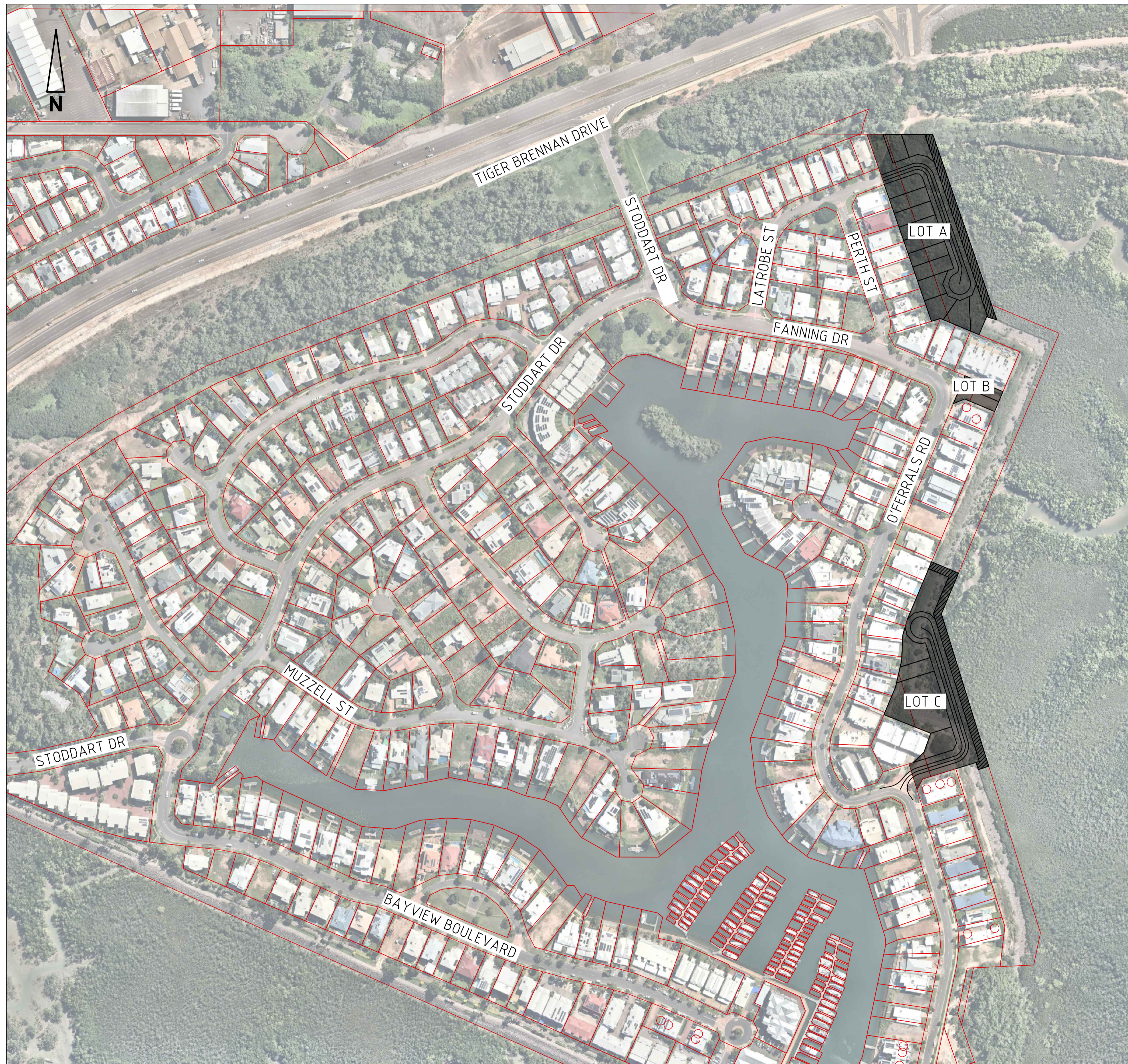
LOCALITY LAYOUT SCALE 1:2000