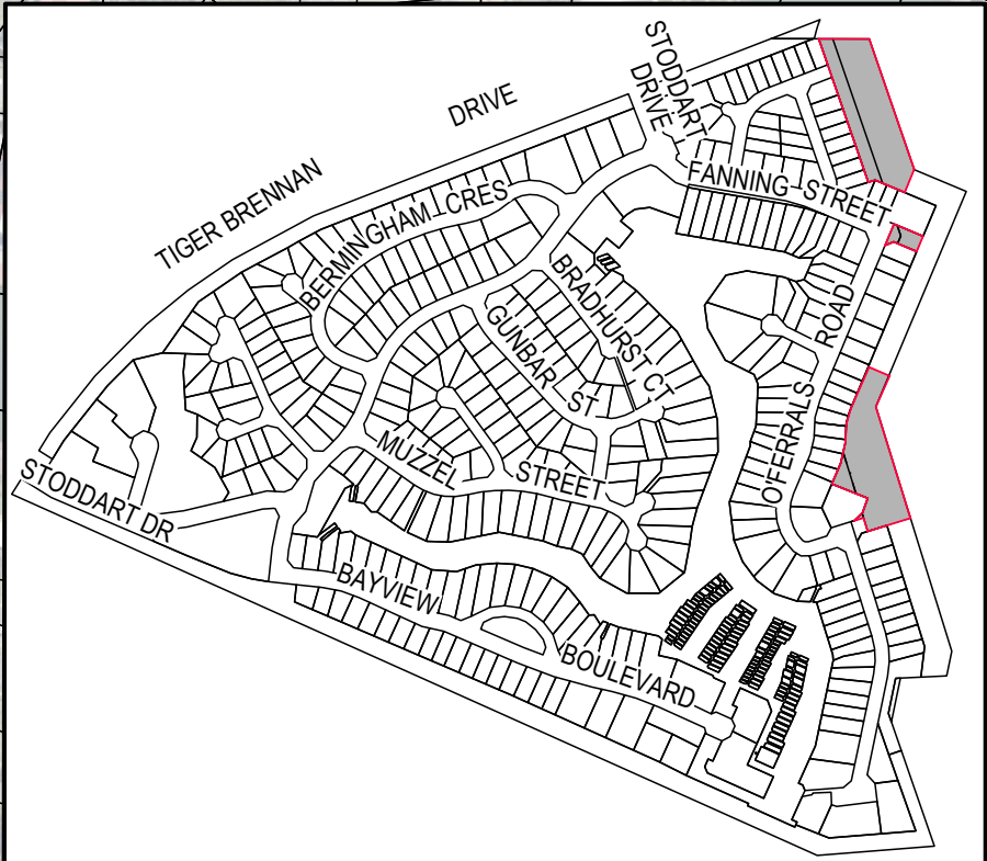
LOCATION DIAGRAM Not to Scale

Area C Refer to plan 8093/29 for details